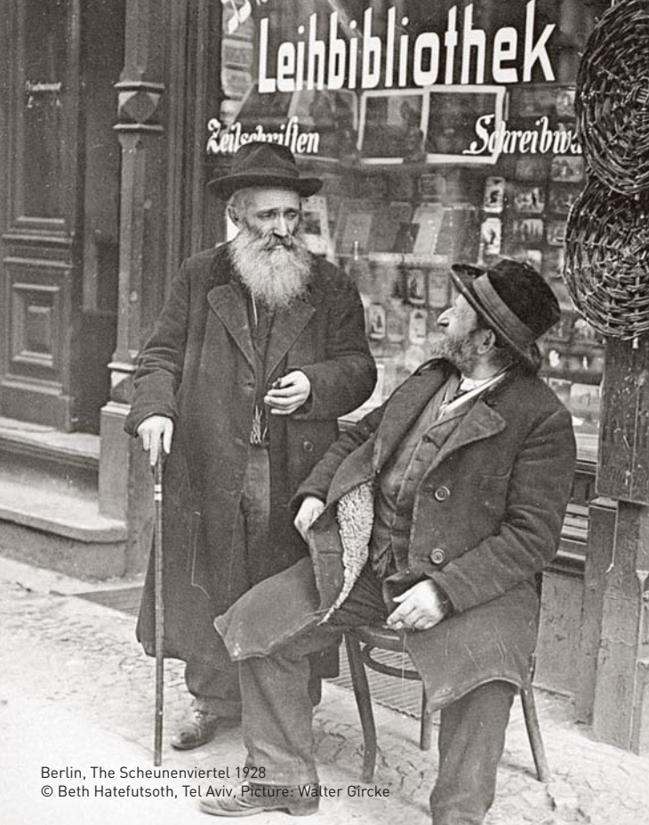
Berlin, The Scheunenviertel 1928